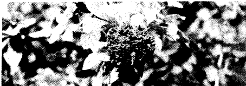
Fig. 1. Immature fruit on shrub near Chimalacatlán, Morelos (Bye & Linares 16038; 30 Aug. 1987).

Randia echinocarpa is a shrub or small tree, 2-6 m high with rigid branches, each short shoot being terminated by four spines. The plant is dioecious but on occasion may be polygamodioecious (Shreve and Wiggins, 1964). The simple, ovate or obovate leaves are opposite and usually evergreen (or drought-deciduous in northwestern Mexico). The solitary flowers are terminal and usually unisexual but sometimes bisexual (Shreve and Wiggins, 1964; Standley, 1926). Pistillate flowers, about 3 cm long, are longer than staminate flowers. The corollas are white, turning orange-yellow with age. The fruits are baccate, subglobose, 4.5-10 cm in