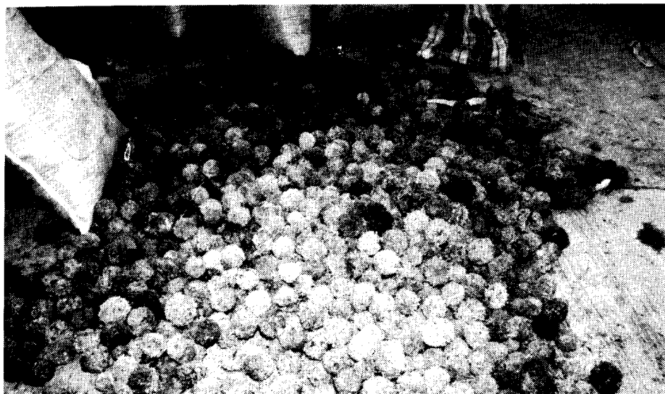
Fig. 3. Fruits of Randia echinocarpa (average diameter of 8 cm). Commercial center near Axochiapan, Morelos, where individual collections are consolidated for commercial wholesale redistribution (26 Oct. 1987).

Isolation of Mannitol: The white solid that precipitated spontaneously from the