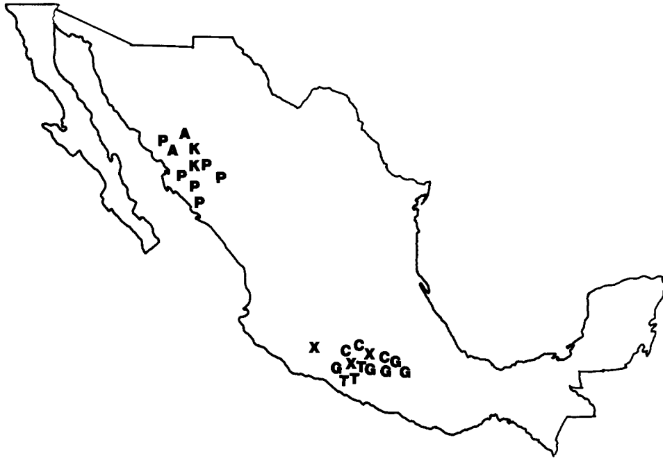
Fig. 4. Distribution of major common name categories of Randia echinocarpa : A = a 2 ságola; C = crucillo; G = granjel; K = kakáwari; P = papache; T = tecoloche; X = xacua.

Two minor basic names from central Mexico are related to morphological features. "Cirián chino" probably refers to the similarity of the dry, hollow fruit to that of Crescentia spp., also known as "cirián" but distinguished by its crinkled surface, hence "chino," a term usually applied to hair with ringlets or curls (Santamaría, 1978). The stem with decussate branches resembles a cross and gives rise to the name "crucillo."