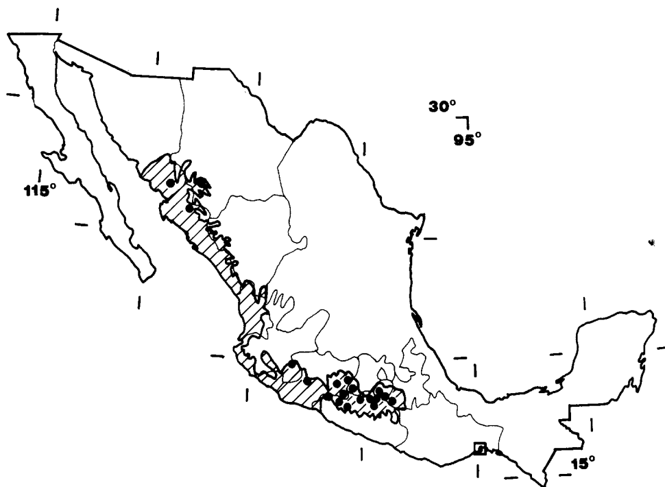
Fig. 2. Distribution of Randia echinocarpa . Dots represent localities from which herbarium specimens originated; diagonal lines cover the probable natural range; square indicates the location of the dubious report of the use of this species by Huave Indians of Oaxaca.

ethnobotanical and floristic publications for northwestern and western Mexico were searched for information on Randia echinocarpa . Distributional, ecological, and ethnobotanical data were obtained from literature and from specimens deposited in the Herbario Nacional (MEXU) and Facultad de Ciencias (FCME), both located at the Universidad Nacional Autónoma de México (UNAM), after the identity of each was confirmed by R. Bye.