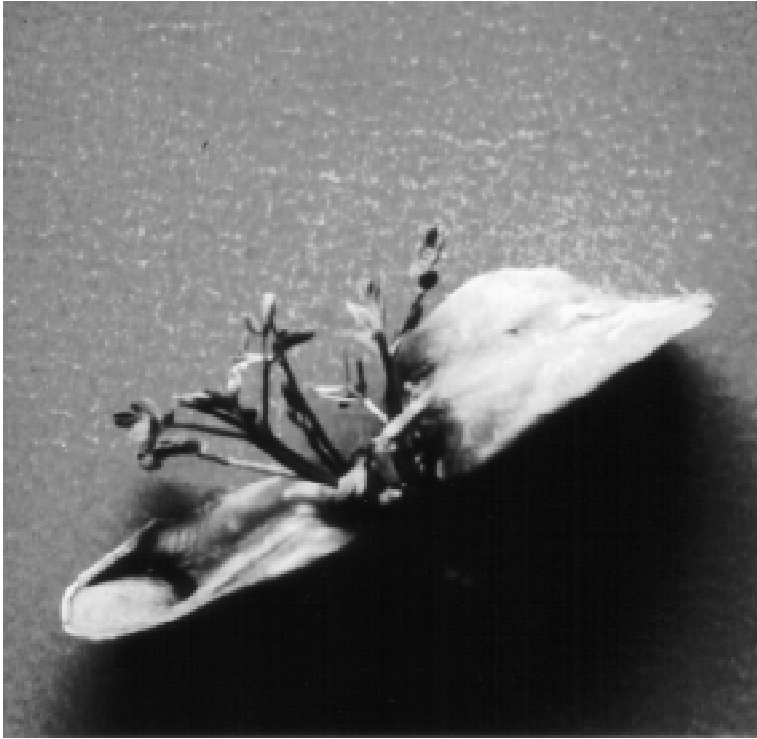
Fig. 2. Cotyledons with hypocotyl of P. glandulosa var. torreyana after 3 months of in vitro culture in MS enriched with KIN 0.05 mg/l. Note the absence of callus.

were performed per treatment regime. Shoot formation on the twenty treatments analyzed was subjected to an ANOVA and a Fisher LSD test using a Statistica w/4.1 program.